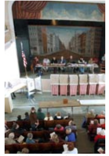
Some local jurisdictions in the United States still practice a form of direct democracy, as in this town meeting in Harwick, Vermont. Schools and taxes tend to be popular issues.

Some U.S. states, in addition, place "propositions" and "referenda" — mandated changes of law — or possible recall of elected officials on ballots during state elections. These practices are forms of direct democracy, expressing the will of a large population. Many practices may have elements of direct democracy. In Switzerland, many important political decisions on issues, including public health, energy, and employment, are subject to a vote by the country's citizens. And some