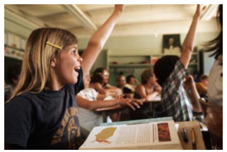
An educated citizenry is, potentially, a free citizenry.

There is a direct connection between education and democratic values: in democratic societies, educational content and practice support habits of democratic governance. This educational transmission process is vital in a democracy because effective democracies are dynamic, evolving forms of government that demand independent thinking by the citizenry. The opportunity for positive social and political change rests in citizens' hands. Governments should not view the education system as a means to indoctrinate students, but devote